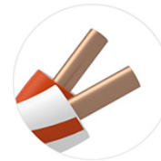
Solid Pure Bare Copper