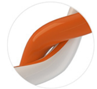
4 Twisted Pairs